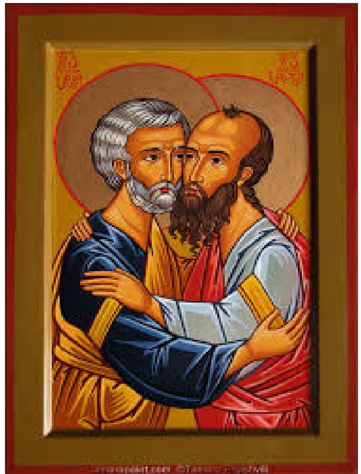
Saints Peter and Paul, Apostles Wednesday, June 29, 2016