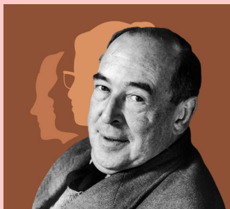
C. S. LEWIS