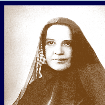
St. Frances Cabrini