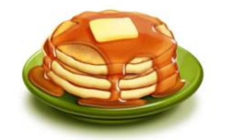
Breakfast includes pancakes, eggs, sausage, bacon, fresh fruit, and beverages. $10 Adults / $5 Youth 6-18 / Free 5 & Under Payment at Front Desk - Cash, Check, Zelle Accepted