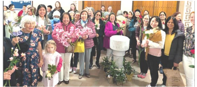
Our Amazing mothers on Mother's Day.