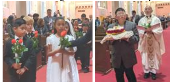
The 1 st communicants also brought their flowers.