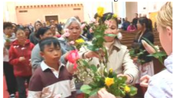
Parishioners processed in bringing their flowers to Mary.