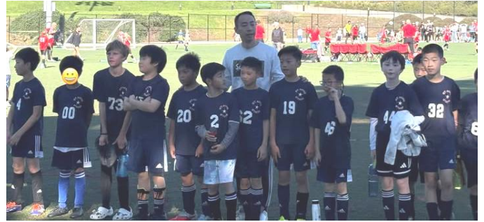
Congrats 5 th Grade – 2 nd Place