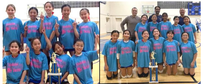
Congrats 4 th & 5 th Grades – 1 st Place