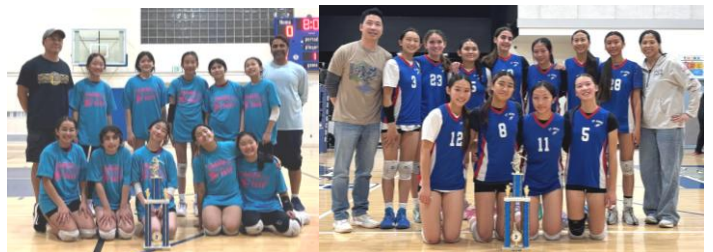
Congrats 6 th & 8 th Grades – 1 st Place