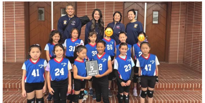
Congrats 3 rd Grade – 2 nd Place