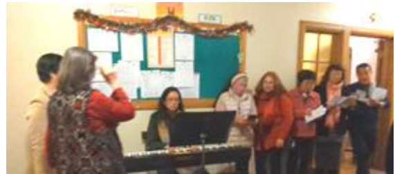
Caroling at the Volunteers Party